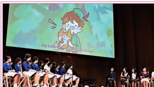
God's love for all creatures