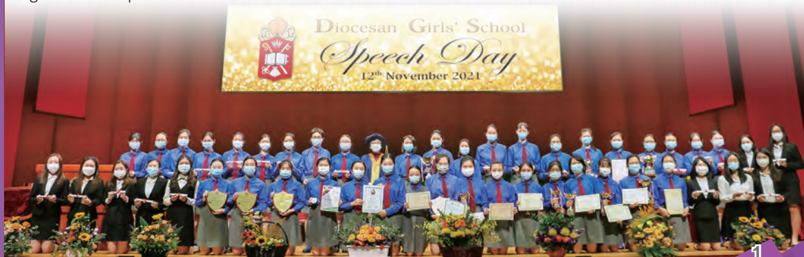
Prizewinners with Headmistress