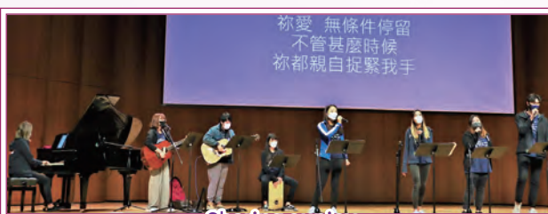
Sharing our joy