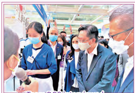
Team DGS interviewed