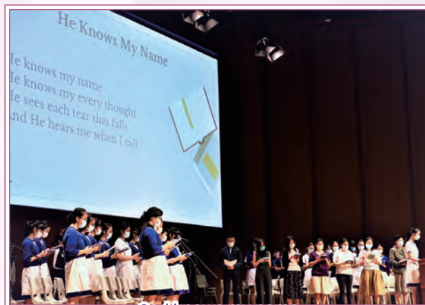
God knows my name