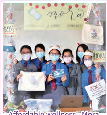
Affordable wellness - Mora