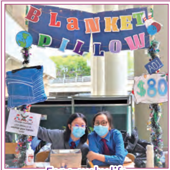
For a cushy life