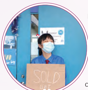
Sorry, sold out

Pandemic restrictions notwithstanding, a festive atmosphere permeated the campus, bringing unadulterated joy to all in the season of merry-making!