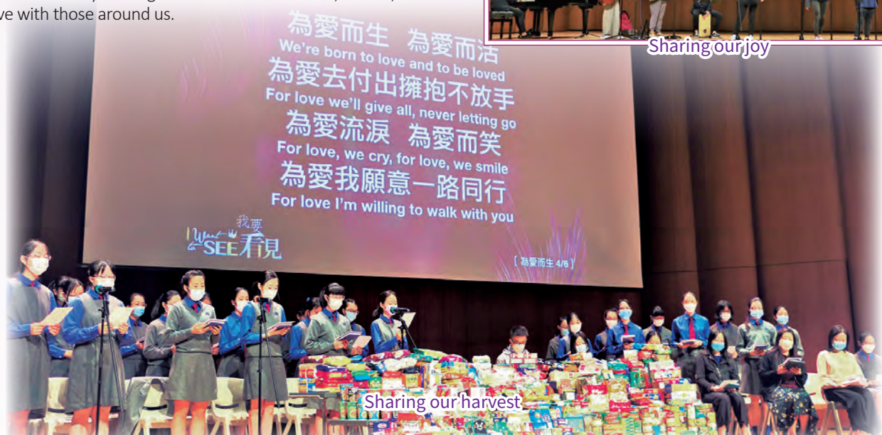
Sharing our harvest

As we continue to uphold the fifth and foundational pillar of the DGS education – spiritual nurturing, as well as the school motto "Daily Giving Service", we pray that our school will continue to grow as a community abiding in the love of God as we, in turn, share this love with those around us.