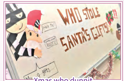
Xmas who dunnit