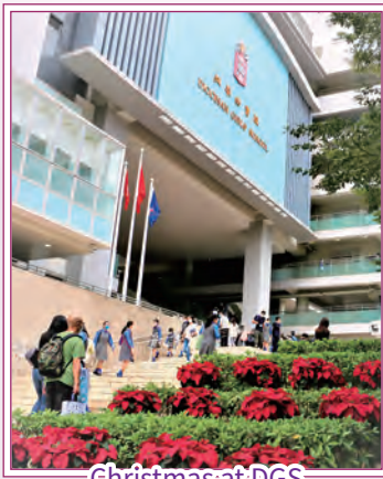
Christmas at DGS

Missing this year due to COVID measures were catering services, but a variety of activities were included like never before. Beautiful Christmas carols performed by our school choirs filled the auditorium during both sessions; the carpark dance routine charmed visitors in the Plaza, in the upper floor corridors, who clapped to the music as they admired the cool moves of our talented dancers.