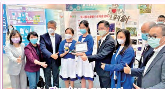
Thumbs up, everyone!

Last summer, a team of DGS innovators was awarded the Gold Prize in the 16 th Soong Ching Ling Award for Children's Invention national competition. Their remarkable accomplishment was highly recognized by the Education Bureau and Innovation and Technology Bureau of the Hong Kong SAR which chose their invention, Asthemeter, to be one